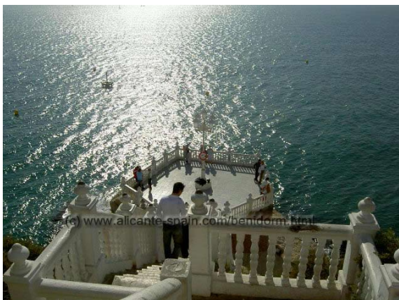
Includes a walk down with a breathtaking view.

Benidorm, which has excellent transport from the Alicante airport, is also a very moving city. During the day, you can