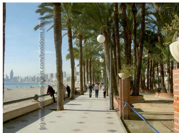
Walking down the southern beach of Poniente.

After a 20 minute drive in your car from the Alicante airport, you arrive at one of the many hotels right on the beach front, but the one that is most outstanding is the Bali, four star and the highest hotel in all of Europe. It was inaugurated about two years ago and its vanguard style, airy atmosphere, luxury rooms and panoramic lateral lifts would make anyone's stay here more pleasurable.