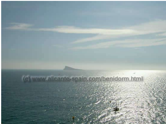
Breathtaking view on the little island of L'Illa just off the coast of Benidorm

tal clear waters in a submarine like catamaran. Everyone has a little bit of adventurer like Robinson Crusoe in their veins and would probably like to have an island for themselves for a short time.