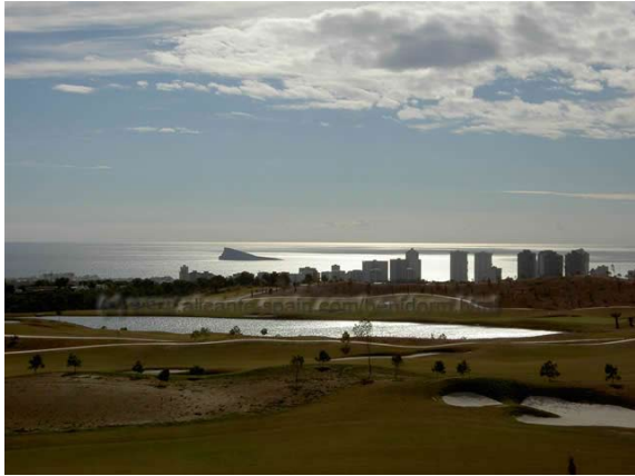
The Golf Course north to Benidorm.

This is not like any other wildlife park. Here, there are four theme areas and a water park. 1.500 animals of over 200 species, 50 of which are in danger of extinction. What a privilege to be the lucky ones to see these living specimens up close! And not only these animals but their natural