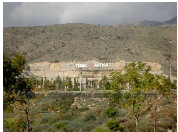
To the North of Benidorm lies the Terra Mitica Theme Park

This theme park is relatively new, having been inaugurated in 2000 and proposing an ambitious project of making it the spot to let your imagination go wild. This park in English is called 'Mythical Park' and clearly lives up to it. Here, anybody and everybody travels back to the legendary civilisations that lived in the Mediterranean, back to where Spain's civilisation began, rewarding you with such attractions such as the Secrets of the Pyramids, the Minotaurus Labyrinth and the Great Odyssey Trip.