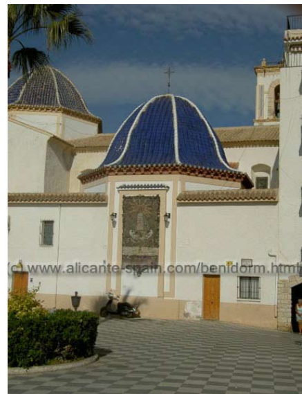
The Iglesia Virgen del Sufragio is part of the nicely maintained old Benidorm.

Benidorm is a year round holiday spot thanks to its weather and variety of entertainment for people of all ages. Other than the theme parks, which are quite a few, you can explore the crys-