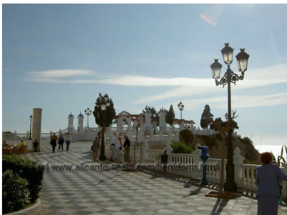
The Balcon del Mediterraneo area close to the old town centre.

So you have come to have a pleasurable stay on the 3 mile wide beach in the bay of Benidorm. The beach there is divided by what was