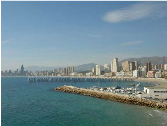
Playa de Poniente - with the little harbor area in the front

Everything seems to be ideal when planning your holidays in Benidorm and its surrounding towns. The geographical location between two mountain ranges gives it its fantastic climate; over 350 days of sunshine and comfortable temperatures in winter and beach degrees in summer.