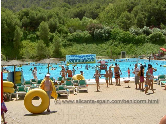
Refreshing on hot summer days the Aqualandia Water Park

So you want to cool down a little but the beach is not your cup of tea? Here at Aqualandia you can enjoy a days outing with the whole family. It is right inside the city and depending are where you are staying, you have convenient buses, can walk or drive there. The gates open from 10 in the morning until 6:30 in the evening with all kinds of water activities for all members of the family.