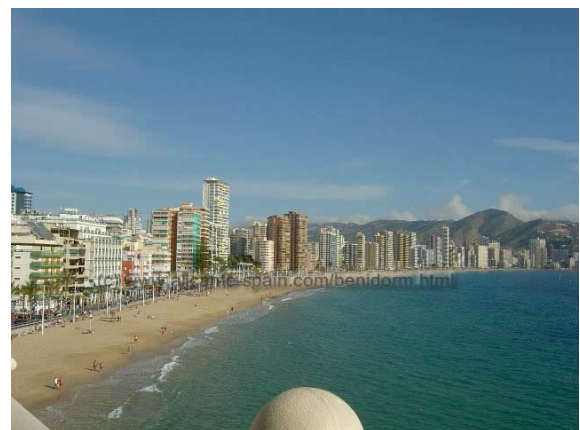
Playa de Levante - the northern beach in Benidorm

This sleepless city is conveniently found just 43 kilometres north of Alicante on the east coast of Spain and can be reached either by taking the national road marked N-332 which takes you right through the city centre or by hopping on the toll road marked AP-7. If taking the pay road, you have various exits which will let you off in the southern, central or northern part of Benidorm. If coming by bus from either the north (Valencia) or the south (Alicante or airport), you will be left off at the shopping mall called Centro Comercial La Noria on Europa Avenue, which is the main street.