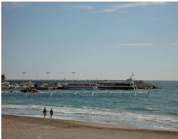
At the harbor area you can get ferry boats to Denia, Alicante, Tabarca Island and other cities along the Costa Blanca.

With its three kilometre long soft sandy beaches; one along the new promenade in front of nicely kept hotels and lively restaurants catering to the tourist in their native tongues, and the other a little outside the old city hub, your days of relaxation are ready. Have an English breakfast sitting at one of the terraced cafes along the Levante beach, a quiet lunch sitting in the tropical gardens at the Gran Hotel Delfin, a midday snack at Cafe de Paris with rich flaky pastries, and either a formal dinner or even more typical, some tapas ( small portions of just about everything you can eat ), highly recommendable is El Calpi with fresh seafood tapas.